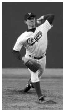
Yes, he was an outstanding pitcher for WSU.