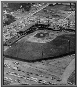
PARKER FIELD YAKIMA, WASHINGTON Sponsored by Logan Wheeler Post No. 36

The 4,400 seat stadium was built at a cost of $50,000, according to reports at the time in the Yakima Herald and Republic newspapers. The grandstand, located near what was then Lenox Avenue (now Nob Hill Boulevard), was an impressive edifice. At its opening, a Yakima Herald article described the new ballpark as "almost a duplicate of the Chicago Cubs' park."