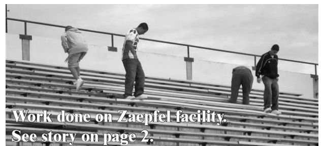
Work done on Zaepfel facility. See story on page 2.