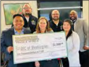
OIC of Washington