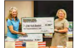
Zillah Youth Softball