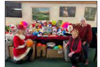
Toys for Tots