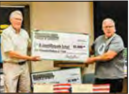
St. Joseph/Marquette School