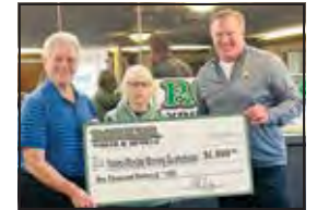
Yakima Monday Morning Quarterbacks