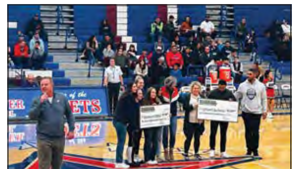
Eisenhower High School