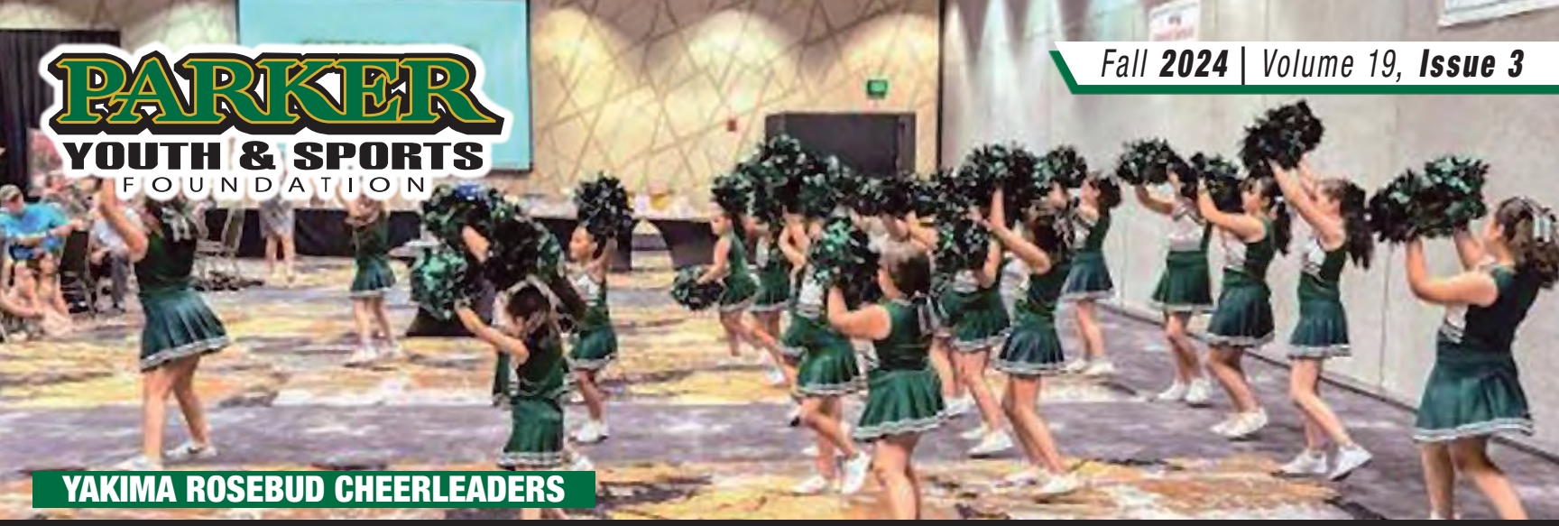
YAKIMA ROSEBUD CHEERLEADERS