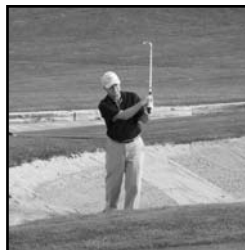
Sweet swing, great results!