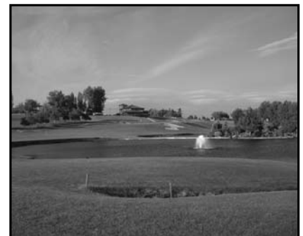
Apple Tree, a championship golf course.