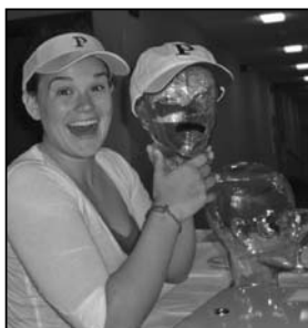
YVCC girls' basketball player modeling new Parker hats.