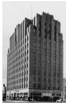
Larson building circa 1937.