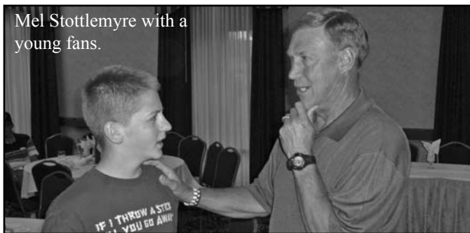
Mel Stottlemyre with a young fans.