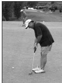
Steady does it on the practice putting green.