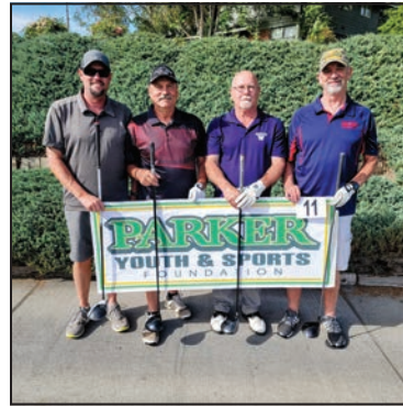
11. VETERAN VFW POST 379