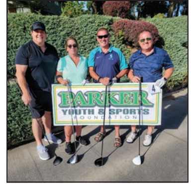
4. MCDONALD'S OF YAKIMA