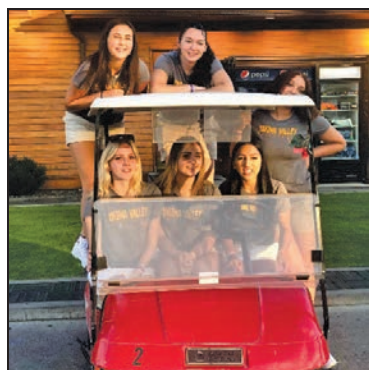
YVC VOLLEYBALL PLAYERS IN CART