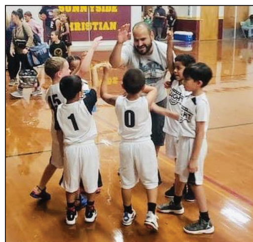
Boy Yakima Flight at Tournament