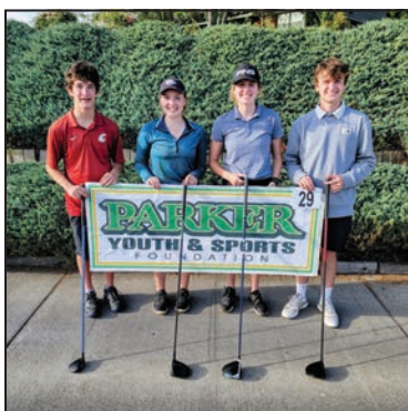
29. SELAH HIGH SCHOOL