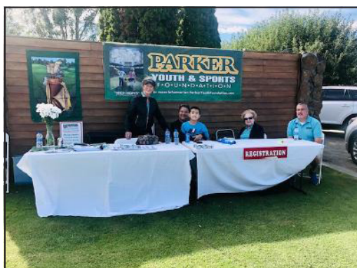
Volunteers Welcome Guests to the Banquet & Golf Tournament!