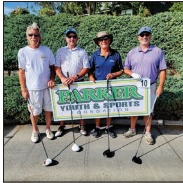
10. '76 YVC BASEBALL CHAMPS