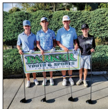
31. WEST VALLEY H.S.