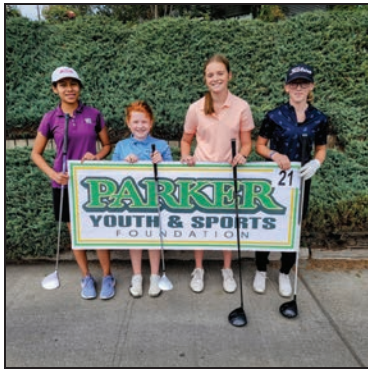
21. FIRST TEE - GALS