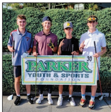
30. DAVIS HIGH SCHOOL