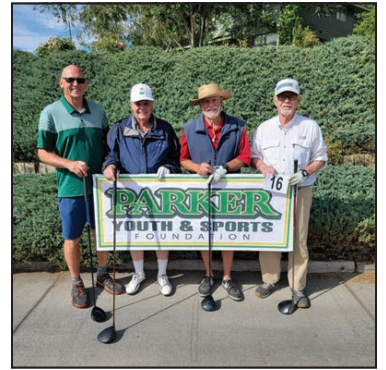
16. MONDAY MORNING QUARTERBACKS