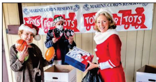
Toys for Tots 2021