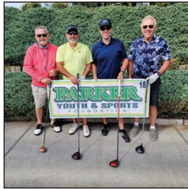
18. GTO CAR WASH