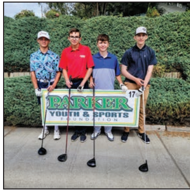
17. EISENHOWER H.S.