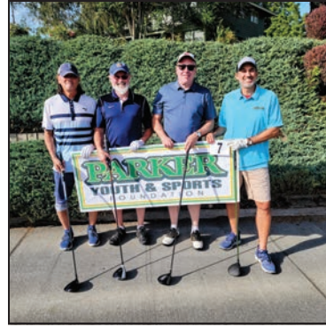
7. HACKERS DELIGHT