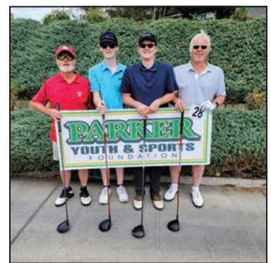
28. FALLER 602 RACING