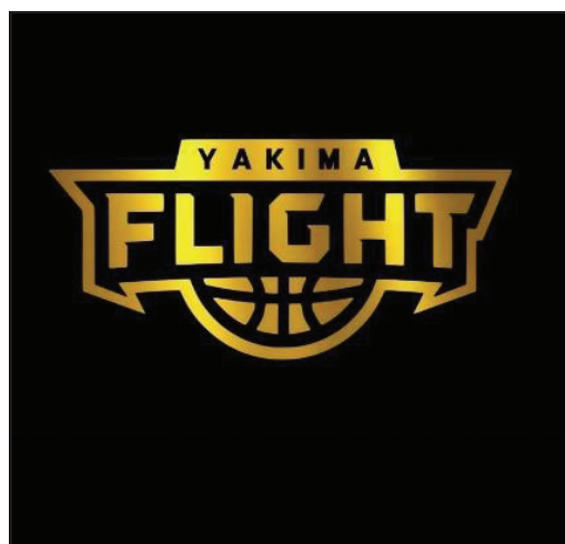
Yakima Flight for Youth Basketball