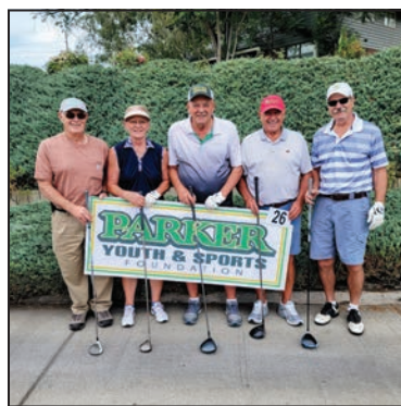
26. '69-'70 YVC FOOTBALL