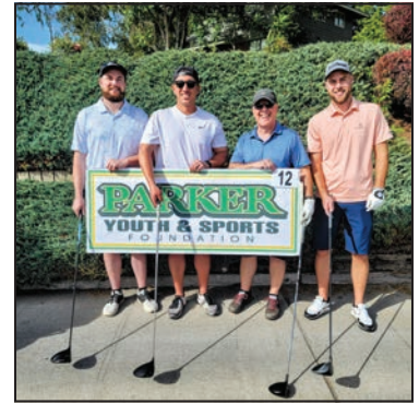
12. FALLER'S FOUR