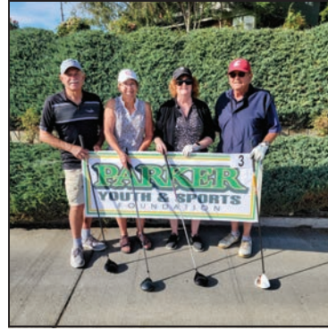
3. COUPLES THERAPY