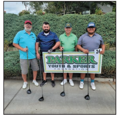
24. FIRST AMERICA REALTY CO.