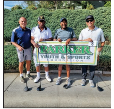
8. OIC OF WASHINGTON