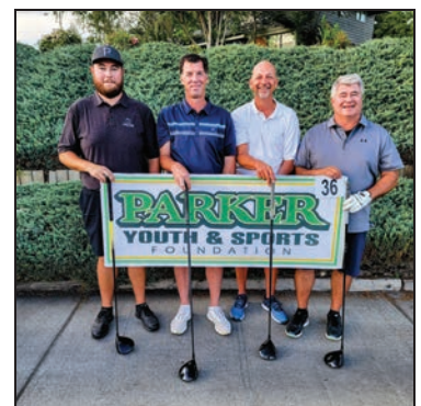
36. MONSON FRUIT