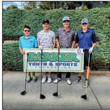
22. FIRST TEE - GUYS