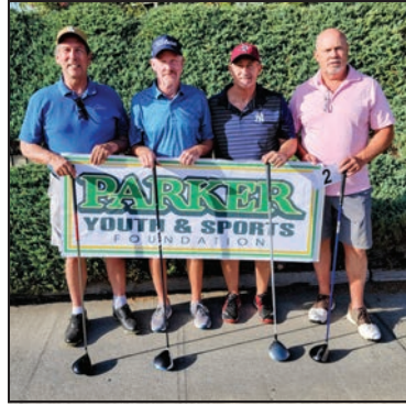
2. '78 YVC BASEBALL