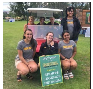
YVC VOLLEYBALL PLAYERS IN CART