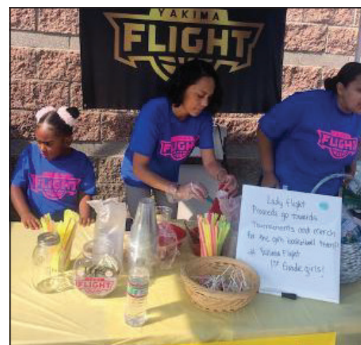
Lady Yakima Flight Cookies Sale

Dear Parker Youth & Sports Foundation board: