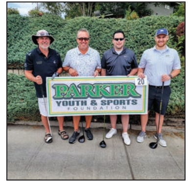
20. STRAIGHT OUT OF BOUNDS