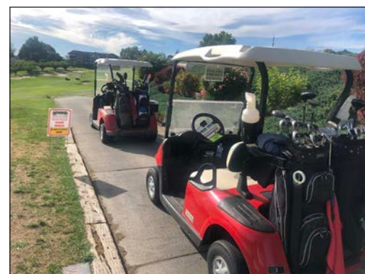
Golf carts line up.