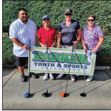
6. '79 LEGION WORLD SERIES BASEBALL CHAMPS