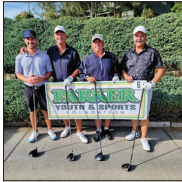
9. SEMO GOLFERS