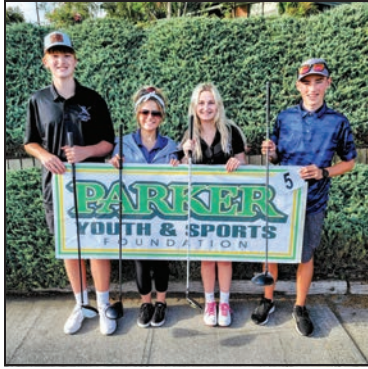
5. LaSALLE H.S.