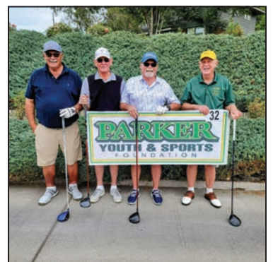
32. GRAYBEARDS INC.