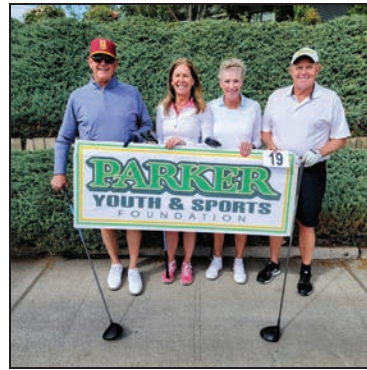
19. YVC COUGARS