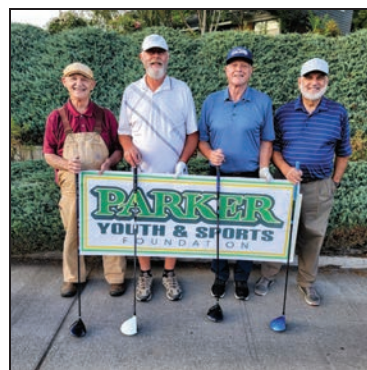
35. THE THIRD DOWNERS