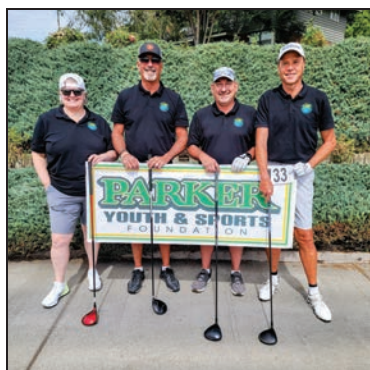
33. YAKIMA CHAMBER OF COMMERCE