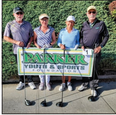
1. PUTT FIRST WINE LATER