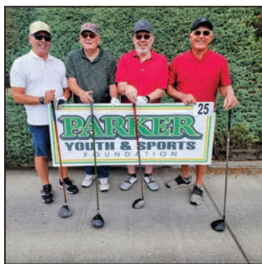
25. '69-'70 YVC BASEBALL