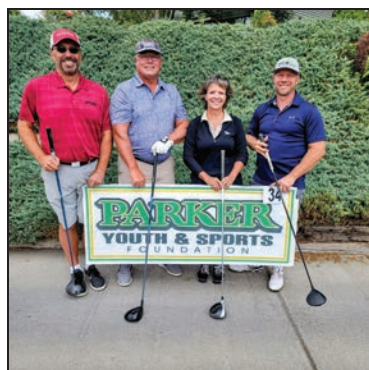
34. EAGLE LANE