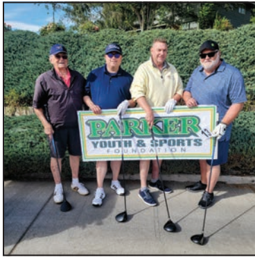
13. MEDIA MADNESS