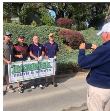
PHIL FOSSUM PHOTOGRAPHS 37 TEAMS!