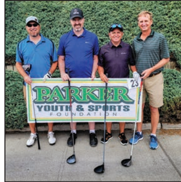
23. BORTON FRUIT INC.