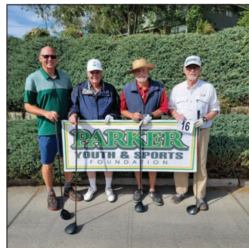
Monday Morning Quarterback Club