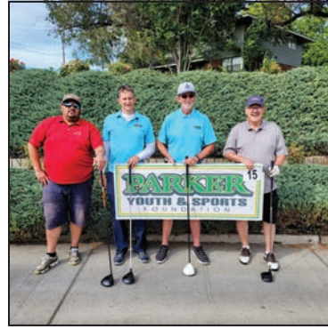
15. YAKIMA YOUTH BASEBALL