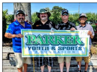
Sports Forum 1