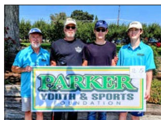
Faller 602 Racing