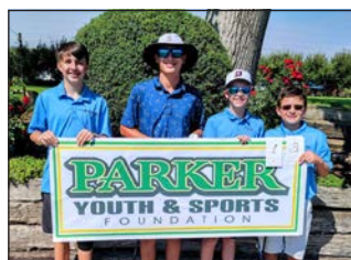
First Tee Boys