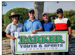
YVC 76-77 Baseball Champs