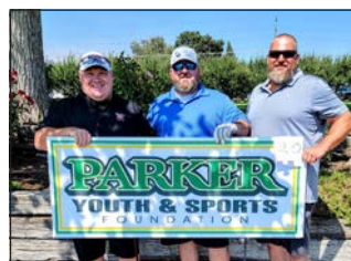
Sports Forum 2