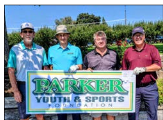
Yakima Youth Baseball