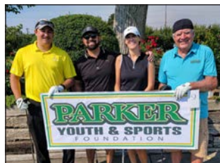
Mid Valley Insurance