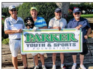
GTO Car Wash