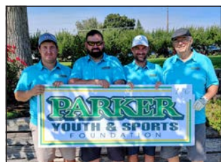
1st American Realty