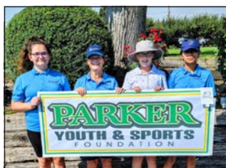
First Tee Golf Girls