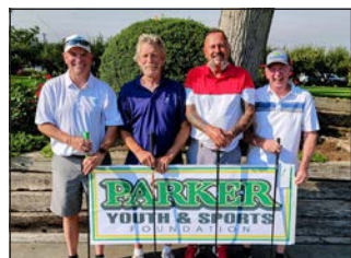
74 YVC Baseball Champs