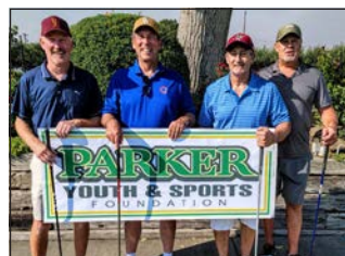
YVC 1978 Baseball Champs