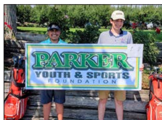
Eisenhower High School