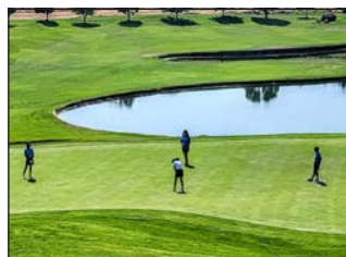
LaSalle High School