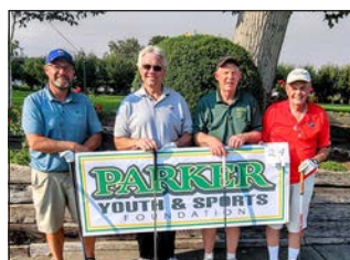
Monday Morning Quarterbacks