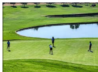
OIC of Washington