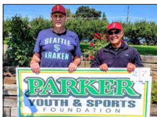
Two Good Golfers