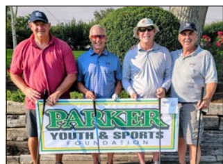
Sons of Thunder