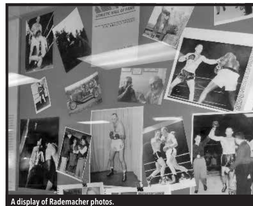
A display of Rademacher photos.