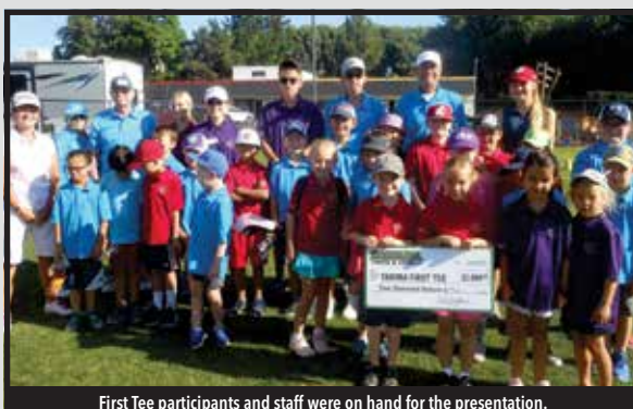
First Tee participants and staff were on hand for the presentation.

The Parker Youth & Sports Foundation has presented a check for $2,000 to The First Tee of Central Washington youth golf program.