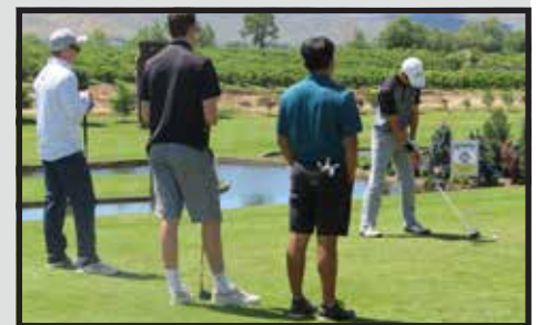
The Davis High School team prepared to play the 16th hole.