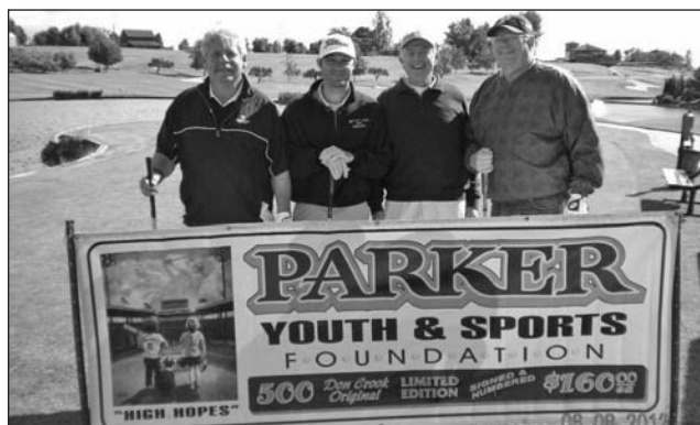
Flight 1 '74 Indians.