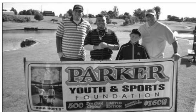
Teams came in all sizes.