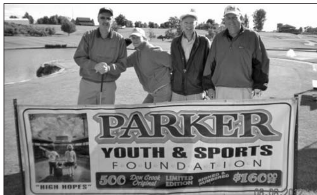
Yakimaniacs – a team that has played every year.