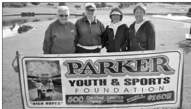
Suntide's ladies team.