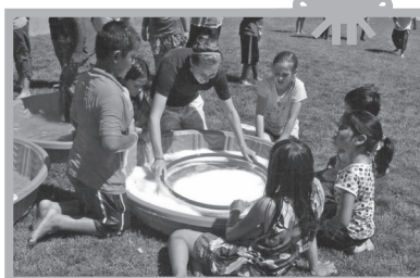
Photos provided by Yakima Parks & Recreation Department from last years' summer program at Kissel Park.