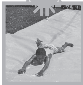
First person to test the Friends in Tieton development age soccer field.