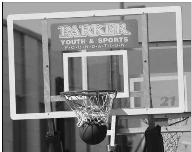
Parker Youth & Sports Foundation sponsored a court at the August Downtown Hot-Shot 3-on-3 tournament.