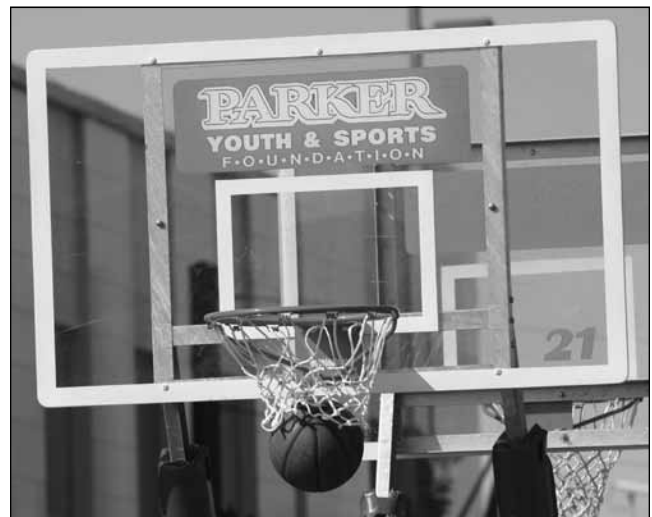
Parker Youth & Sports Foundation sponsored a court at the August Downtown Hot-Shot 3-on-3 tournament.