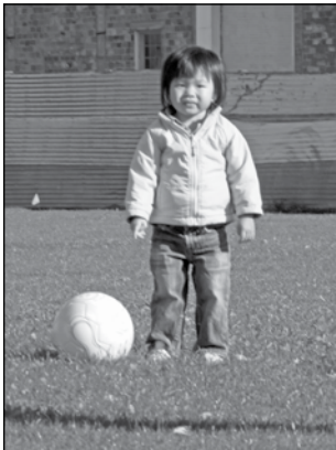
First person to test the Friends in Tieton development age soccer field.