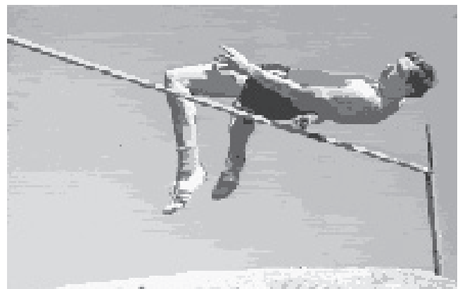
Fosbury Flop, invented by Dick Fosbury while at Medford High School, Medford, Oregon.