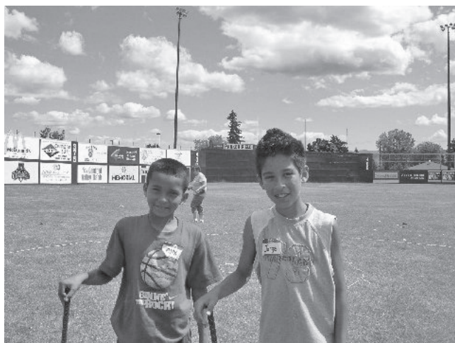
Two young guys enjoying the Parker Field Day at the 1 st Tee session.

“Parker Kids Sports Day,” was held on the Yakima Valley Community College campus from 11 a.m. to 4 p.m. on Friday, June 19. The staffs from Yakima Valley Community College athletics, the Yakima Parks and Recreation Department, First Tee of Yakima, the Yakima YMCA, the Yakima Police Athletic League, and Yakima Fire and Rescue, provided four 45-minute sessions of athletic and lifetime skills - baseball, basketball, golf, soccer, softball, and volleyball.