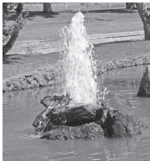
Apple Tree Golf Course and Resort provided an array of special backdrops on a beautiful day of golf.