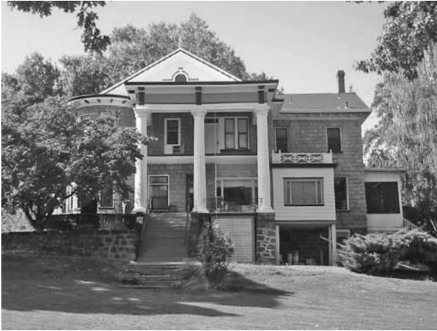
Renovated second story sitting porch is hung by support chains to the ceiling of the porch.