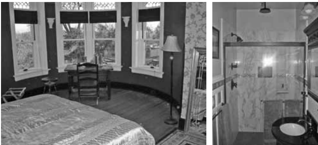
Recently remodeled bedroom.