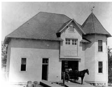
Mrs. Larson's driver lived in the second story turret.

Original stalls remain in the two-story carriage house on the north side. The carriage house served as a lumberyard and horse and buggy lodging in the early days. The upper floor has been converted to a 3,000-square-foot residential rental.