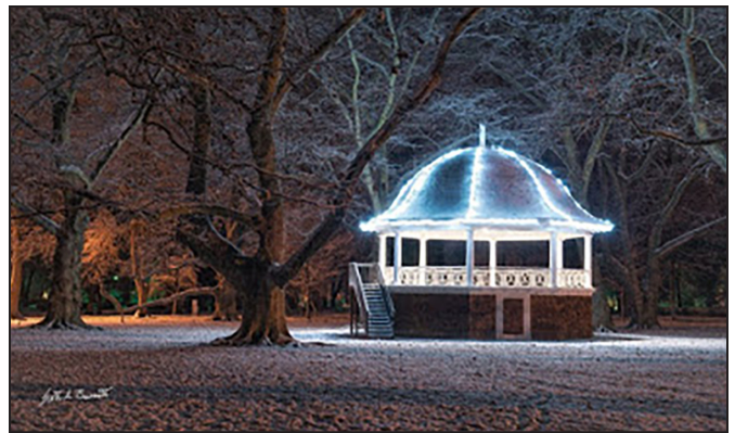
Bandstand located south of Garden Center and still used for musical performances.