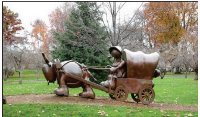
Bronze wagon located in front of Garden Center.