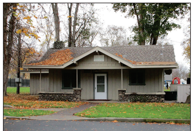
Garden Center that may become a family project to update its failings.

The park has many interesting features and has been a gathering place for our families for years. A number of us had high school graduation photos taken among its attractions – bird aviary, pond with ducks, bandstand, rose gardens, old tree with a climbable swing like limb, cannon, pool, and now modern children's playground and bronze statues. See a history of the park on page 3.