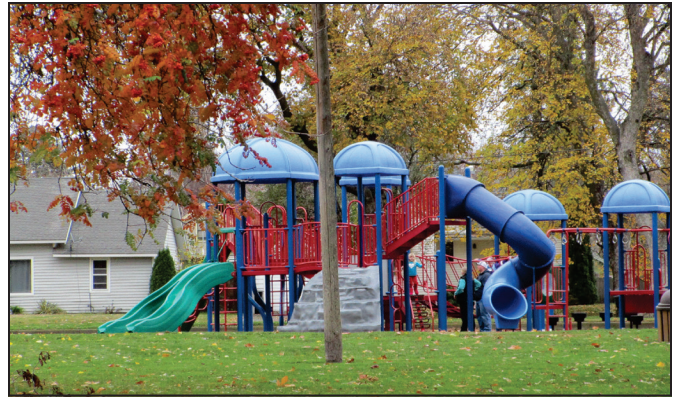
Playground equipment located behind the Garden Center for kids zone entertainment.